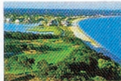
Sebonack Golf Club